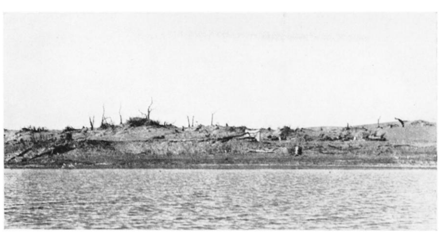
Dead toghraqs on the banks of the Qum Darya