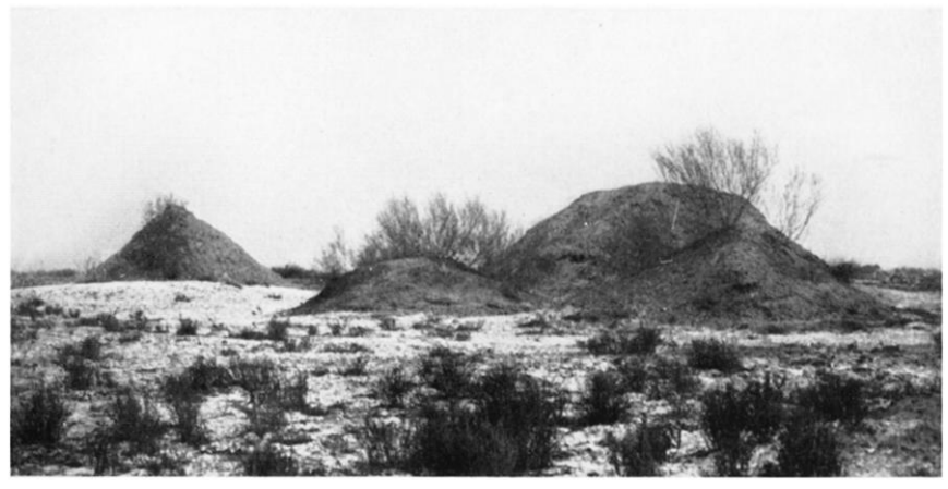
Dead and living tamarisks near Ordeklik on Kashgar-Maralbashi road