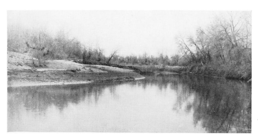
The Qara Köl river south of Maralbashi