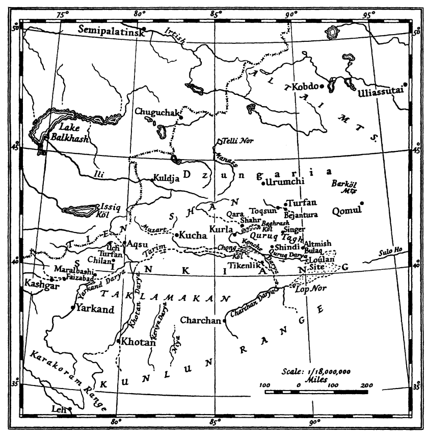
Sketch-map to illustrate Colonel Schomberg's paper on the Tarim Basin

striking geographically in Central Asia as the ubiquity of drainageless basins, which vary from basins so large as almost to lose their individual character, such as the Aral or Caspian seas, to small cups in the mountains or shallow lagoons in the plains. The whole of the Tarim Basin south of the Tien Shan is of this character, but so too is the Dzungarian region north of those mountains. Both these immense districts are similar in many respects; and it is thought that the behaviour of the rivers in both places explains at once the