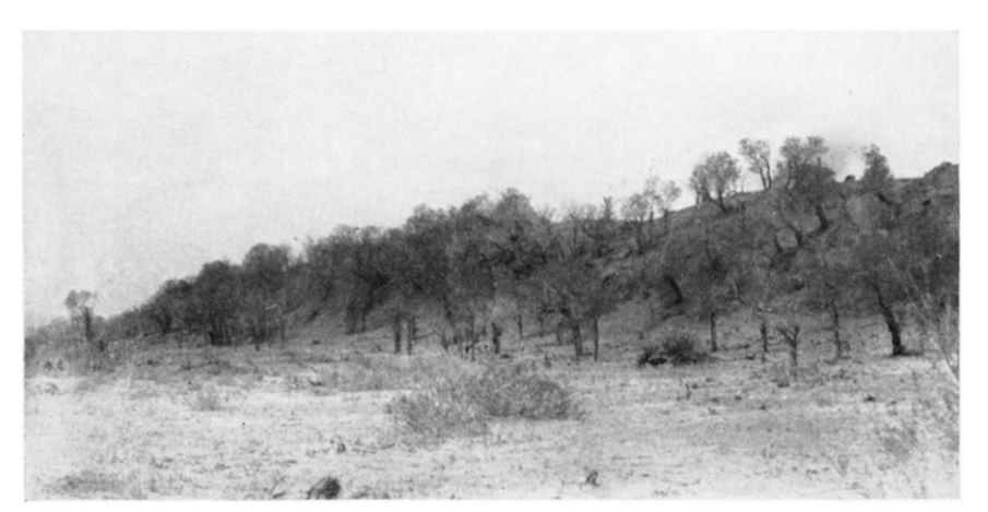
Toghraqs growing in sand by the left bank of the Manass