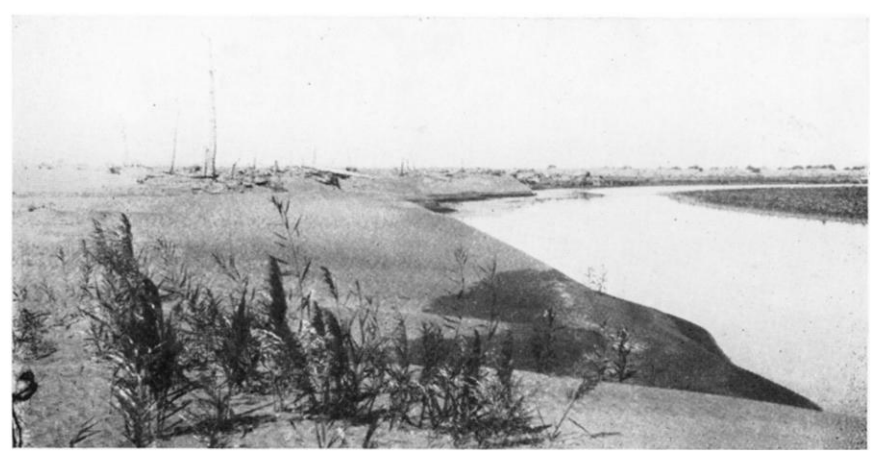
The Qum Darya near Yingpan